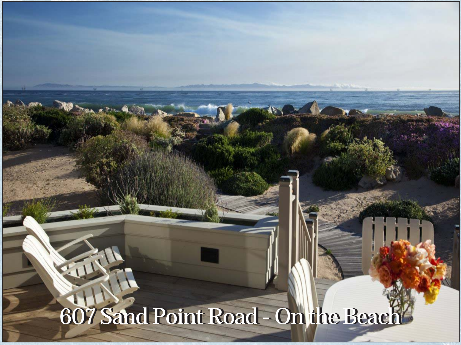
607 Sand Point Road - On the Beach