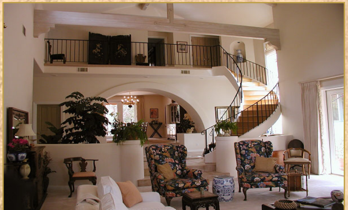
LIVING ROOM/DINING ROOM