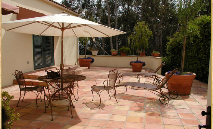
LIVING ROOM PATIO